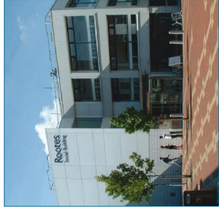
49. Rootes, Conference Park