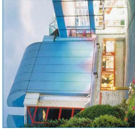
61. Warwick Arts Centre